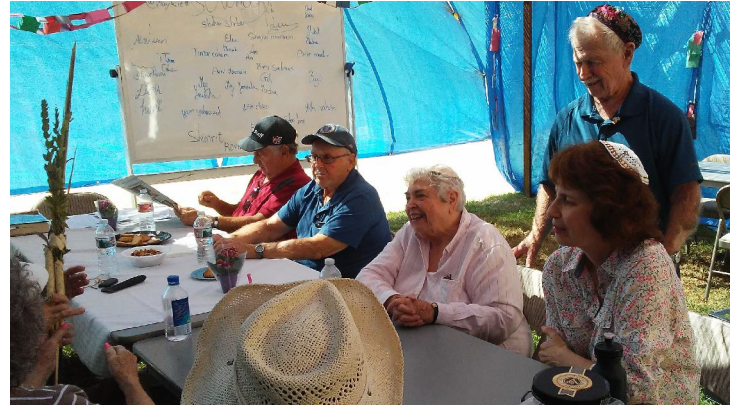
Shabbat Torah study at de Toledo High School sukkah Saturday, September 29, 2018