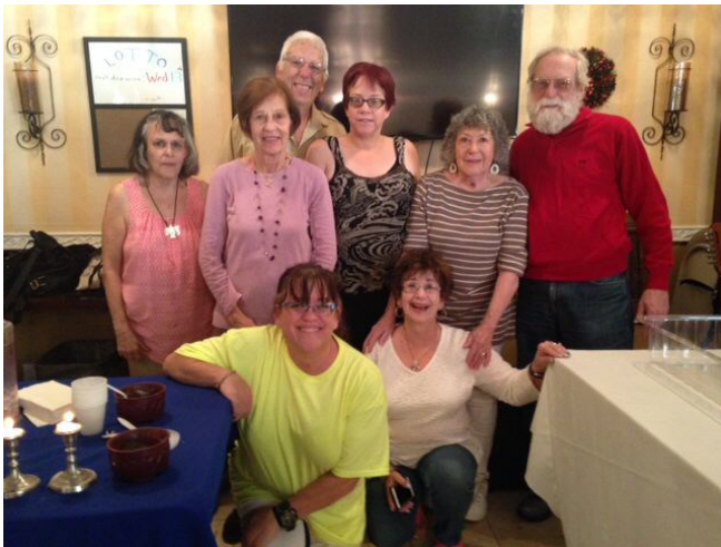
Members of Social Action Committee at West Valley Healthcare celebrating Hanukkah 2017