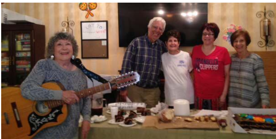
Members of Social Action Committee at West Valley Healthcare celebrating Mother's/Father's Day 2017