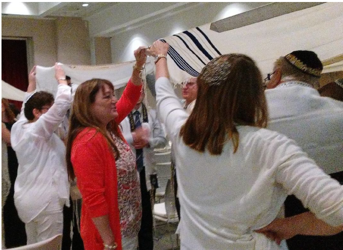
Our custom of children walking under tallit held by congregants after Yom Kippur Neilah service 2018