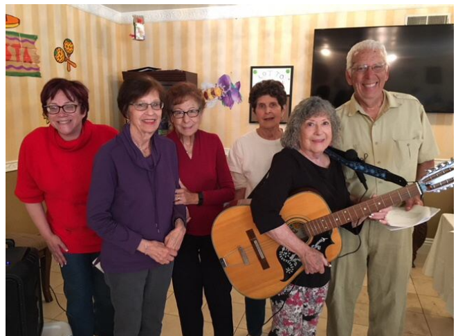
Members of Social Action Committee at West Valley Healthcare celebrating Mother's/Father's Day 2018